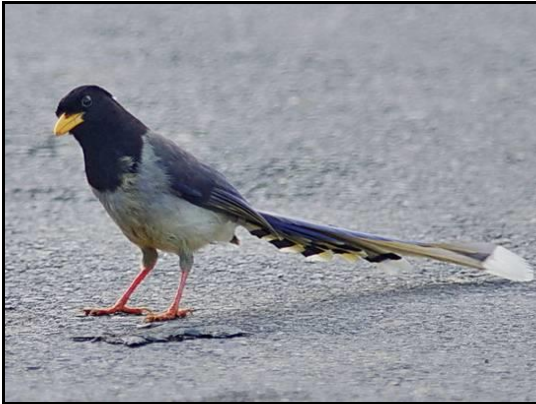
Yellow-billed Blue Magpie