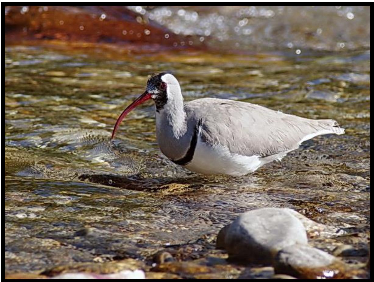
Ibisbill is one of the targets on our November Bhutan tour.